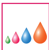
Piezo Variable Drop