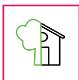
Outdoor / indoor