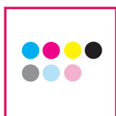
CMYK + Lk, Lc & Lm

* For heavy-duty applications where mechanical stress or environmental impact is involved (floor, vehicle and machine graphics), lamination is required. Stabilisation is required prior to lamination.